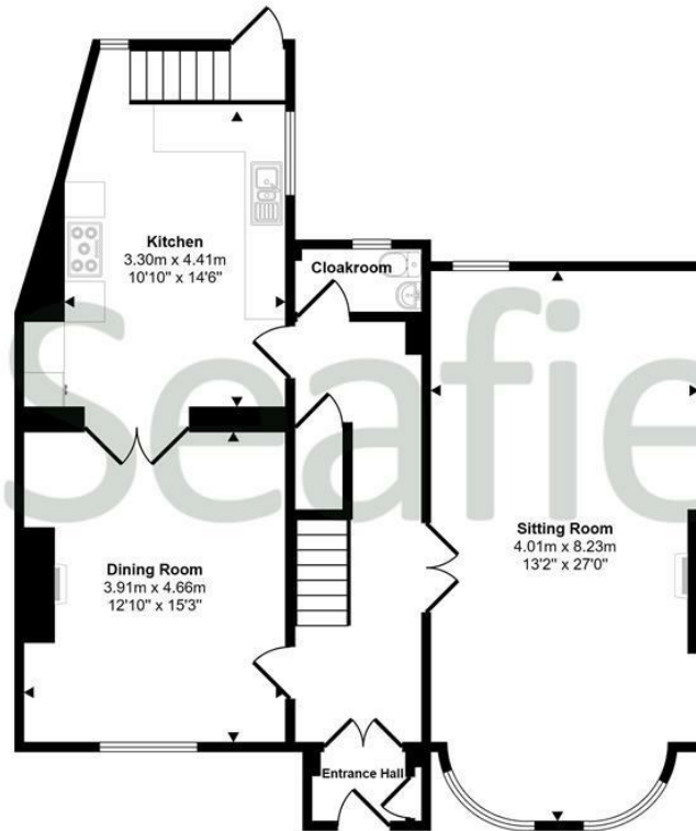
Ground Floor Approx 87 sq m / 938 sq ft